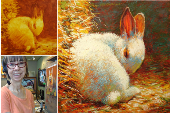
Registration link in description or IG profile, or visit RitaKirkman.com

“Layering the Light” ONLINE Pastel Workshop with Rita Kirkman June 17-19, 2021